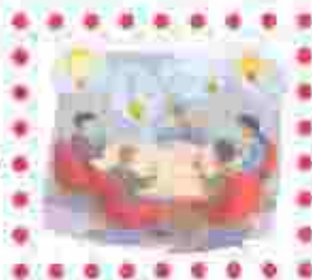
We need your input!

Hey! The Club has found itself a new meeting place! The VSA extends heartfelt thanks to the staff of The People Place, Nixon Wenger, and the Morning Star who, in a joint effort, provide meeting space for non-profit organizations. Thank you!