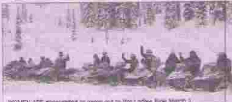
WOMEN ARE encouraged to come out to the Ladies Ride March 2.

After unloading the sleds there will be a warm-up and demonstration at the track. Snowmobile Association and also be